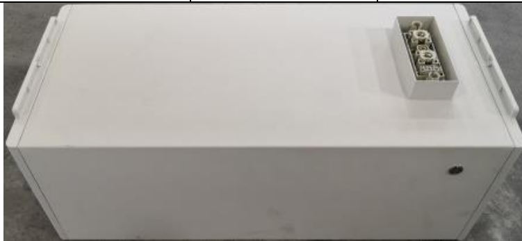
电池图片 Battery picture